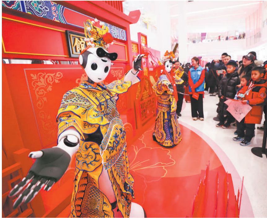
People enjoy a performance by robots at a Spring Festival science and technology temple fair in Haidian district of Beijing, January 30, 2025.

Notably, one highlight is 16 humanoid robots performing a Chinese folk dance Yangge at the 2025 Spring Festival Gala. They wowed audiences in China and overseas with their incredible agility and synchronized dance moves, with on-