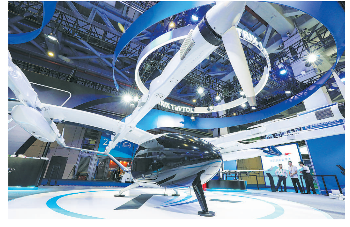
The Matrix 1 manned electric vertical take-off and landing vehicle developed by a Chinese company makes its debut at the sixth China International Import Expo held in Shanghai from November 5 to 10, 2023.