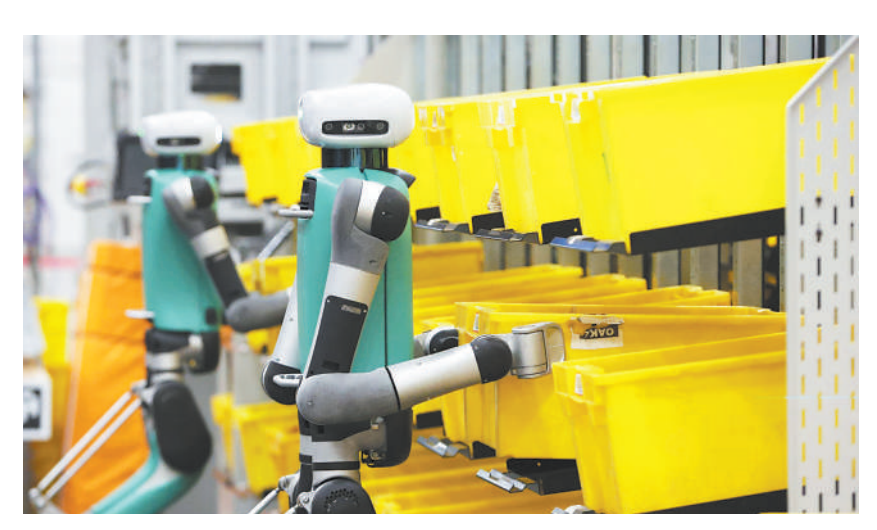
A human-like robot carries an empty box in a warehouse. (PHOTO: SCREENSHOT)