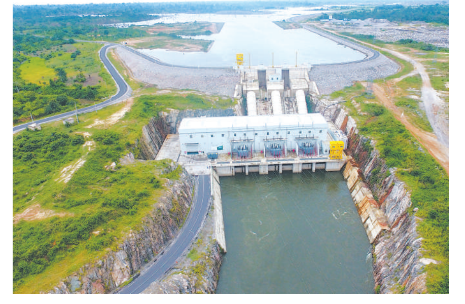
The Soubre hydroelectric power station in Côte d'Ivoire.

Over the past decade, China has always adhered to green development, strengthened international cooperation in the field of ecological and environment governance, biodiversity conservation and climate change, committing to building an ecological civilization where