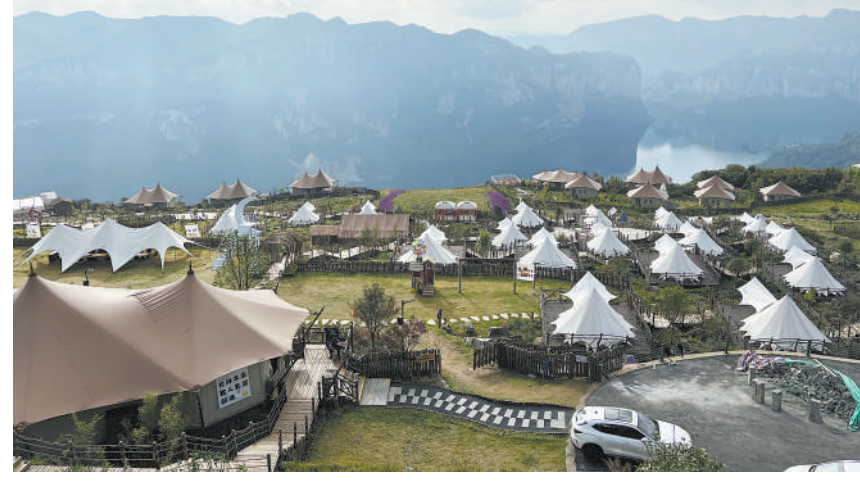
Huawu village is equipped with 5G for rural management.

In addition, livestreaming e- commerce has boosted the sales of local products like yellow rice cakes, yellow ginger and Miao embroidery, increasing the income of local villagers.