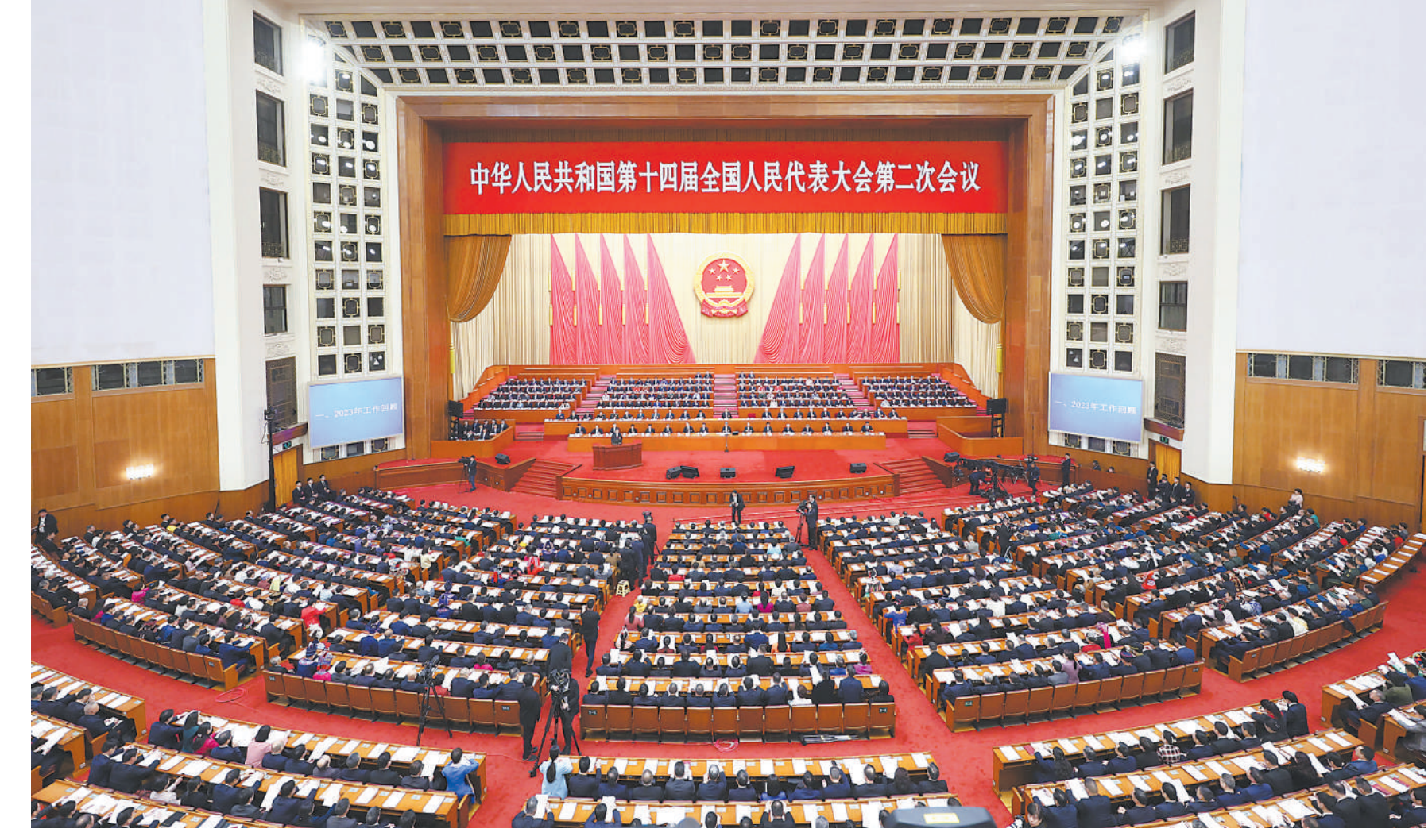
The opening meeting of the second session of the 14th National People's Congress (NPC) is held at the Great Hall of the People in Beijing, China, March 5, 2024.

China will also expand science and technology exchanges and cooperation with other countries, promote international personnel exchanges, and create an open and globally competitive innovation ecosystem, the report added.