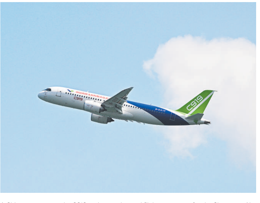
A Chinese passenger jet C919 makes a rehearsal flight to prepare for the Singapore Airshow in Singapore, February 18, 2024.

C919 and the cost of going green by 2050 dominated the opening day of the airshow, Bloomberg reported.