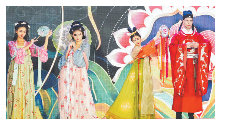
Traditional Chinese costumes and opera during the China-Philippines cultural activities held in Manila, the Philippines in October 2023.

In his article Khanna also mentioned that, from a functional perspec-